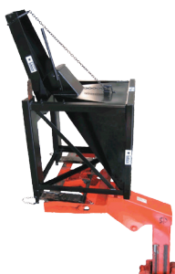
Concrete Hoppers - Turns Your forklift into A concrete placer.

Visit www.starindustries.com or call us at 800-541-1797 for more information on these and other great products.