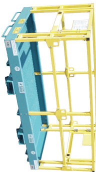
Safety Work Platforms - Turn your forklift into an Aerial work platform