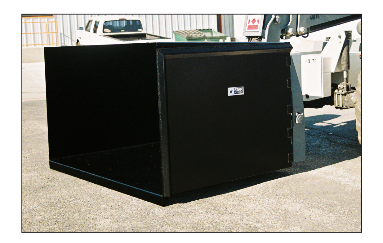
Be sure and include the empty weight of trash hopper in with the weight of your load.